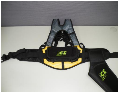
Back pack of battery