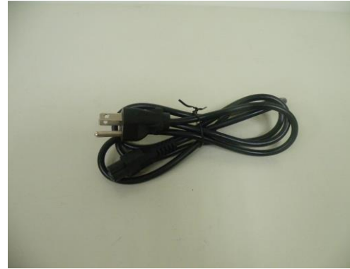
Power Cord of Charger